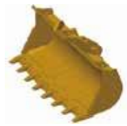
XCMG approved attachments