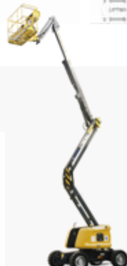
Aerial work platforms